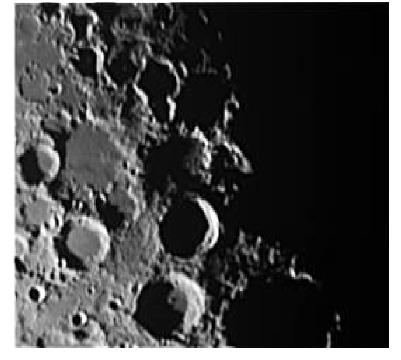
Werner X Nov 8, 2005 @ 2030 UT Telescope with video camera