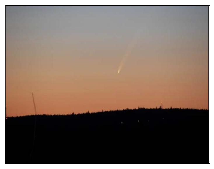
Comet McNaught Jan 11, 2007 @ 5:36 p.m. AST