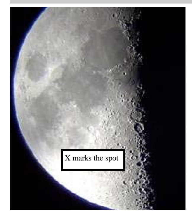
Werner X Nov 8, 2005 @ 2043 UT 11cm f/10 refractor @ 40x