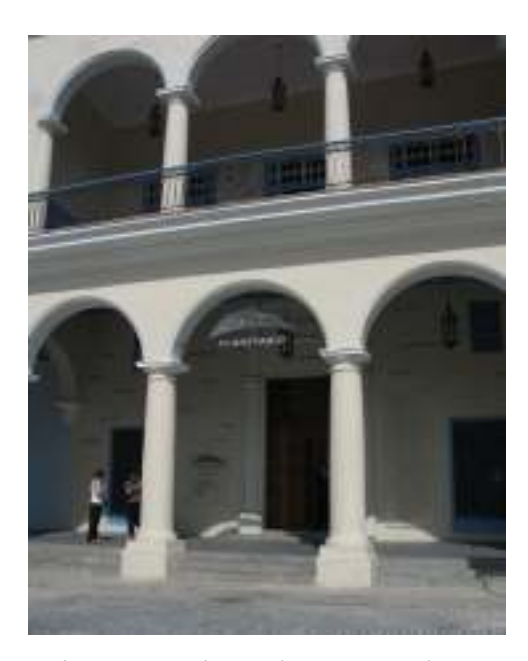
The Havana planetarium, once a cinema

"Now I will try to answer the specific question regarding why people believe in the extraterrestrial origin of UFOs. This is not a question for the physical sciences to resolve; rather it lies in the domain of evolutionary biology, psychology, and neuroscience. The one element that distinguishes humans from all other known life forms is our large brain. The evolution of the brain has allowed humans to imagine realities that do not yet exist. Hence we can develop tools to assist our work, de-