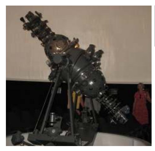
The planetarium projector

projector (not a complete show). The views of the heavens projected onto the 10-metre dome were spectacular! The building is a former cinema in Plaza Vieja (Old Square) and is situated a stone's throw from the Havana Taverna, which brews its own beer. (For the duration of our visit, the Havana Taverna became our temporary HQ, much as The Henry House is for our activities in Halifax.)