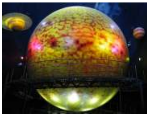
The "Sun" contains the theatre and planetarium projector

In conclusion, Plan C (which was not really a plan at all) turned out to be an enjoyable and productive session of astronomy outreach in Havana, with the added benefit of meeting new astronomy friends. With almost a year to plan for a possible next trip, there's no telling what will go wrong! I will keep you posted.