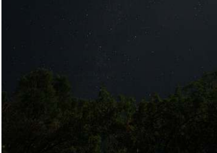
Keji at night. Nova Scotia's first Dark Sky Preserve The lake shot (left) was illuminated by a waning gibbous Moon - note the meteor streak