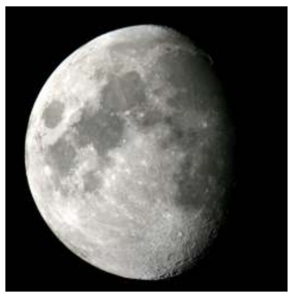
The Moon on OTM Night:

By-the-way, the evening part of the observing was done at the edge of the same graveyard in which we had laid to rest our friends earlier in the afternoon. All in all it had made a very memorable day and a fitting farewell."