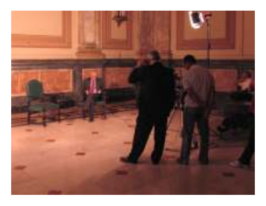
Making of the video on UFOs in Havana

"This is an interesting question and I thank you for inviting me to comment on it. First, I should say that I am not a specialist in this area of study, so I can only answer in my capacity as an amateur astronomer and as a critical thinker.