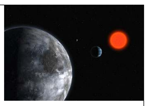
Artist's concept of the dim red dwarf star Gliese 581 and company. In reality, even a "red" star would be dazzling yellow-orange if seen close up.

could even pick your ideal temperature zone between the hot permanent noon point and the cold permanent midnight point. "Any emerging life forms would have a wide range of stable climates to choose from and to evolve around, depending on their longitude," Vogt said.