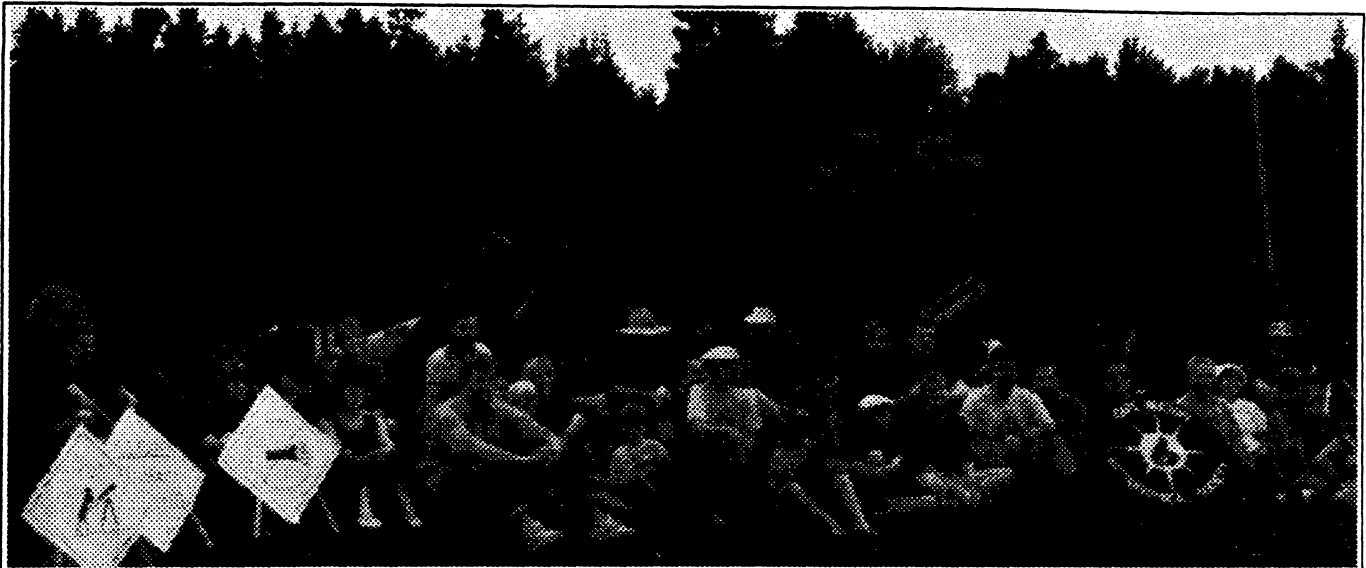
Nova East '92 - A popular summer activity sponsored by the Halifax Centre

Marking the head of Orion, is Lambda, lying some 1,800 ly's distant. It is an elegant double star, with both members being type O and separated 4.4" (2,400 AU). Both should appear white, but yellow & purple, yellow & red, white & violet, and white & white have been reported. Lambda Orionis forms a small \frac{1}{2}^\circ triangle with the two fourth magnitude stars to the south, Phi-1 and Phi-2.