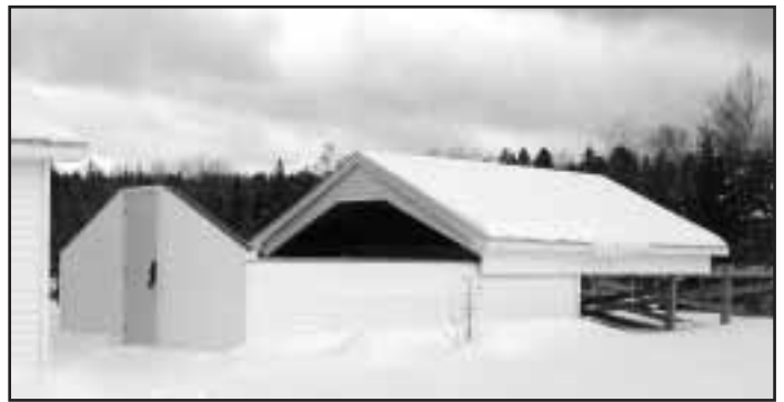
The Saint Croix Observatory—it's a little warmer there this time of year.