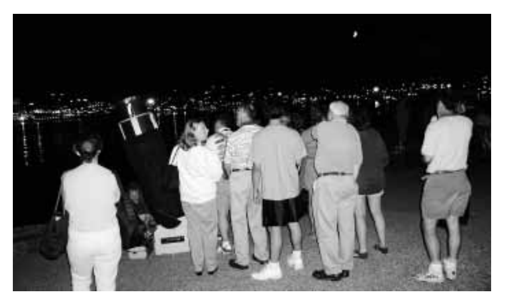
This years Public Public observing event was held at Alderney Landing in Dartmouth on August 13, 2002. Here curious community members look over the Halifax skyline at the slim crescent moon.