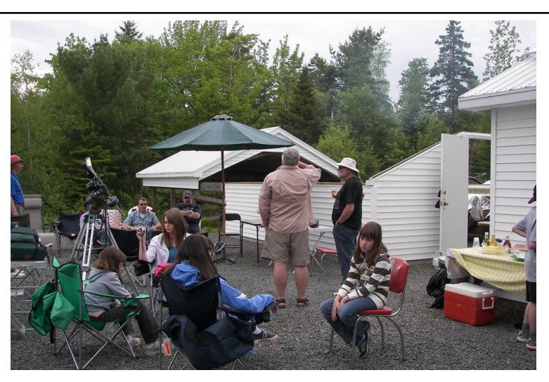
No shortage of food, participants or discussion

I cannot recall if we have had a similar event in the intervening years.