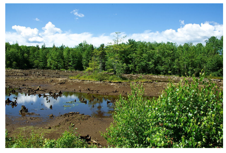
An unusual view of the lake at SCO Several weeks after the Open House the lake at was drained for maintenance of the dam. I wonder what happened to the fish?