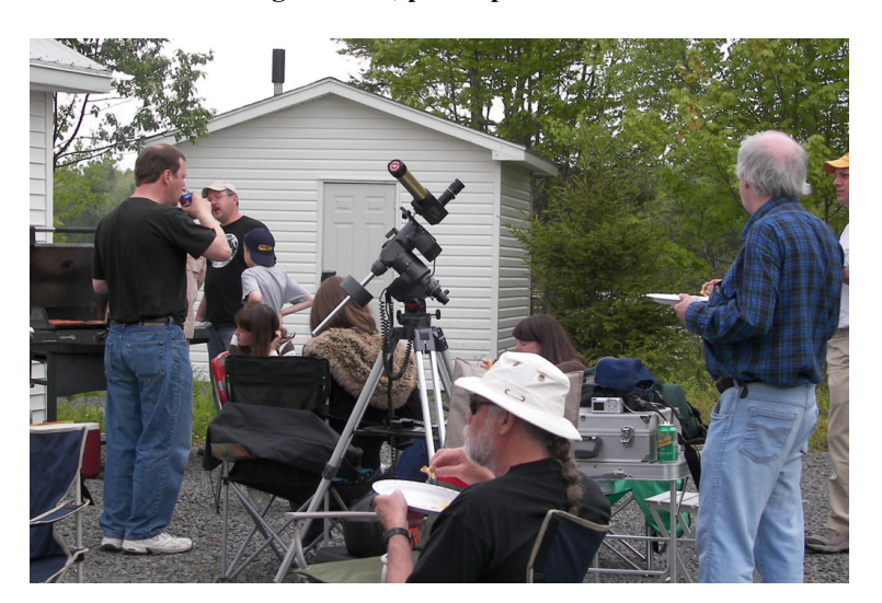
The great weather allowed solar observing during the day