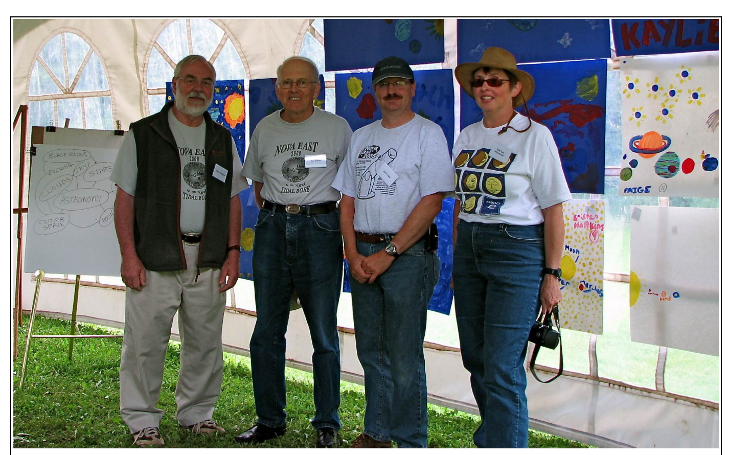
"The Four Asteroids" (photo taken by Daryl Dewolfe at Nova East 2008)

And if you want to go via the ultimate crème de la crème, you can rent time on one of the professional scopes (sniff sniff)!