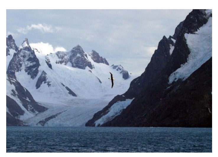
Drygalki Fjord South Georgia

In 1915 Shackleton sailed to South Georgia Island in an open boat from a stranded expedition in Antarctica and was the first to cross the mountainous island to reach the whaling station, Grytviken. He got help and rescued his party in Antarctica. Later, in 1922, he return to the Antarctic and South Georgia where died of a heart attack at the age of 47.