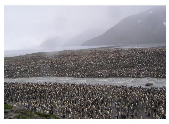
Penguins St Andrews Bay South Georgia