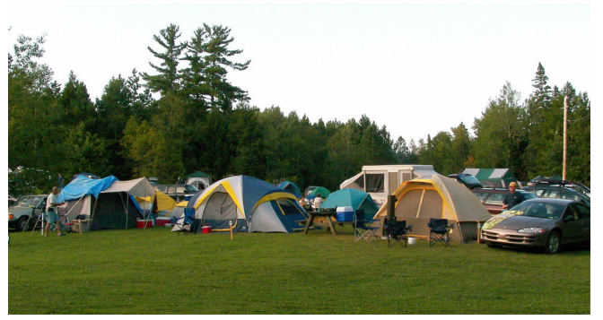
Two views of the Nova East camping area on Sunny Saturday