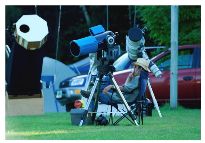
A fine collection of astronomical equipment