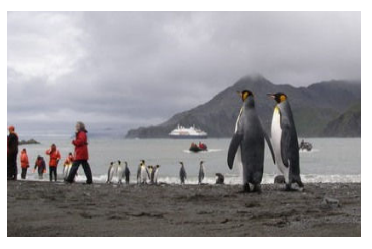
Right Whale Bay South Georgia