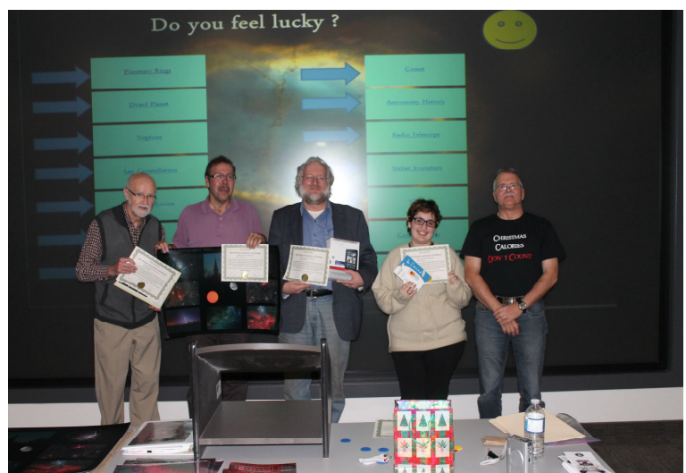
Five Gazers gazing—and a partridge in a pear tree!