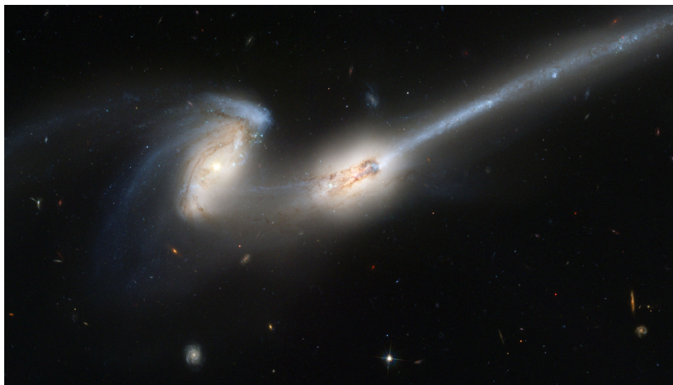
Merging galaxies NGC 4676 (Hubble Space Telescope)

Following a reminder of the sidewalk observing at Atlantic Photo Supply's Burnside location on January 21st, the meeting adjourned a little after 9:30 p.m. for refreshments and further conversation with our speaker. It was well worth the trip on a cold night!